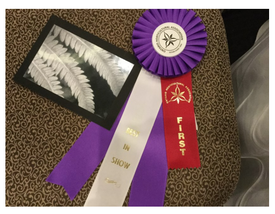
Figure 1. Wade Pitman, Best in Photography Show, "Patterns in Black & White"

Congratulations to all District 6 entrants.