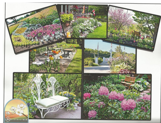
District 6 Garden

At the District 6 meeting last week, the members presented OHA Fund Raiser - 18 Month Calendar. Each calendar month shows pictures of one District. The order of the pages was chosen based on the photo competition to create the calendar. They are selling for $20 each. The deadline is Oct 10. If you are interested in supporting this fund-raiser please bring $20 to the October 3. Please see Marie to place an order.