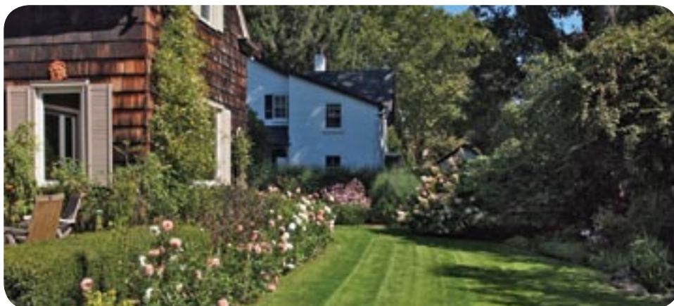
The sun-drenched and shady Garden 4 on the Garden Tour

...My garden is my life. I tend to get along better with plants than I do people, hence you will often hear me referring to them as my children. I am all about causing a stir in the garden - not me myself, but by cleverly utilizing the full spectrum of rare and unusual perennials, trees and shrubs that are becoming more and more increasingly available, if you know where to look.