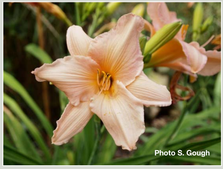
Hemerocallis 'Dance Ballerina Dance'

For a complete listing of upcoming events please visit our website at www.oakvillehort.org.