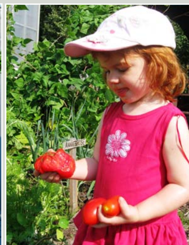
Some of last year's Junior Gardeners with their excellent harvest