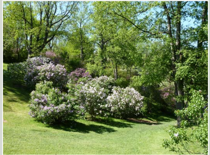
The Lilac Dell at the Royal Botanical Gardens May 26th