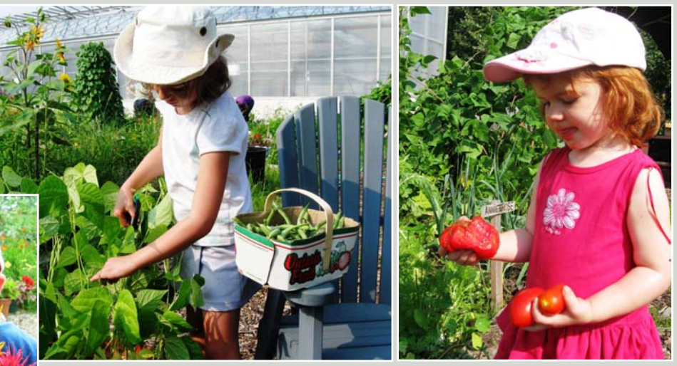
Some of last year's Junior Gardeners with their excellent harvest