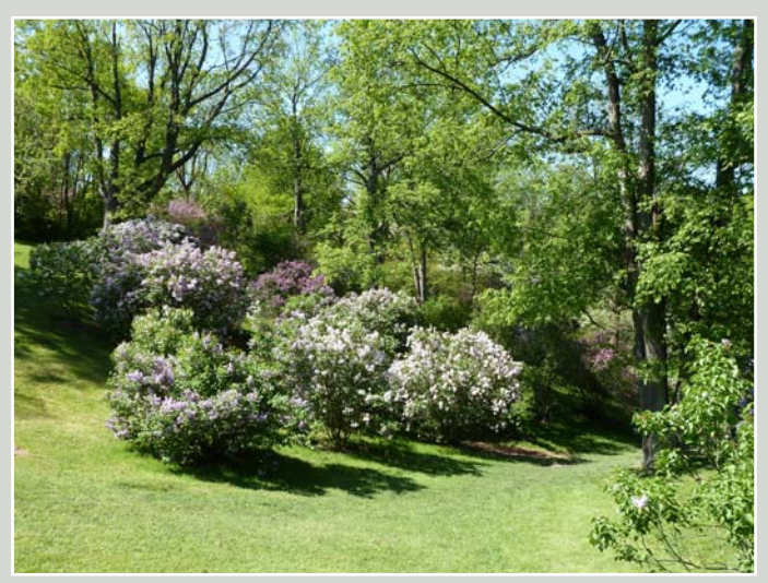
The Lilac Dell at the Royal Botanical Gardens May 26th

RBG Celebrate Lilacs! 25 May - June 19th at the Arboretum Oakville Horticultural Society Garden Tour June 9th 10-4:00 p.m. www.oakvillehort.org TBG Garden Tour June 8 & 9th - Gardens of Forest Hill www.torontobotanicalgarden.ca Oshawa Peony Festival June 8 & 9th - Oshawa Valley Botanical Gardens www.oshawa.ca