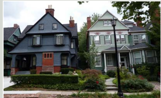
A Buffalo Garden Walk neighbourhood Learn more from Rob Howard at our next meeting

For a complete listing of upcoming events please visit our website at www.oakvillehort.org .